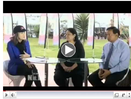
Leading Filipino Environmental Voice Silenced at U N Climate Talks

We would have understood sending our condolences as an emergency if city council would have taken protecting our community as an emergency . They were unwilling to discuss the state of emergency that they created . It seems to me that was like a slap in the face. They are not willing to do anything until we die? And then it will be a proclamation to our family.