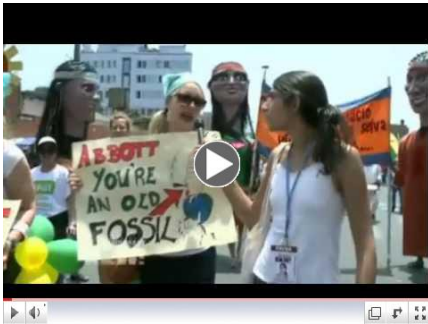
Putting People Before Profit

We love our Pilipino brothers and sisters that's why we shared the clip in a past email from Democracy Now that tells us about the destruction oil companies are causing and how the Philippines is one of the hardest hit.