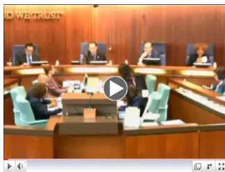
Add emergency item to agenda

We would have understood sending our condolences as an emergency if city council would have taken protecting our community as an emergency . They were unwilling to discuss the state of emergency that they created . It seems to me that was like a slap in the face. They are not willing to do anything until we die? And then it will be a proclamation to our family.