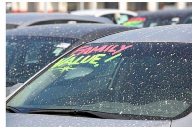
thick layer of ash covers the cars at Scott Robinson Honda on Hawthorne Blvd Wednesday following the explosion at the Exxon/Mobil refinery in Torrance.