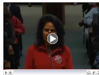
Speakers Request Emergency Item

It seems now that Oxy has backed out of the fight (not drilling in Carson) just the fight in Carson. We don't have to worry about the bullies they bused in to rob us of our voice and right to protect our residents.