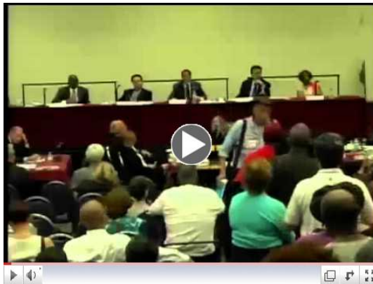
April 29 2105 Public Hearing to Extend Moratorium Speakers

The City Council held several meetings regarding these and other petroleum related issues on March 18, 2014, April 15, 2014, April 29, 2014, and May 20, 2014. On May 2014, the City Council directed City Staff to commence a complete and comprehensive review to update the Municipal Code regarding oil and gas operations and to study and address all modern-day drilling issues and applications.