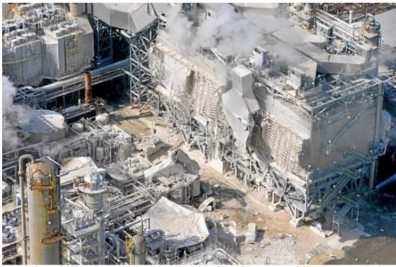
Aerial view of affected area at the Exxon/Mobil refinery in Torrance following an explosion and fire on Feb. 28, 2015. By The Los Angeles News Group Editorial Board, The Daily Breeze